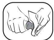
Clean the applicator with cotton towel or absorbent paper until visually dry and clean