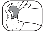
Unscrew the applicator cap