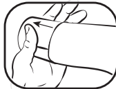
Pull off the transparent protective cover