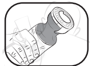
Squeeze the tube to release required amount of Pain Relief Gel