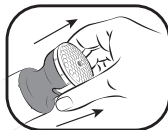
Pull white part to open