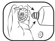
Screw the applicator cap back on the tube