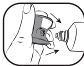
Using the key on the applicator cap to remove the star seal on the tube